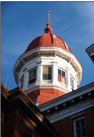
Babcock Building Cupola

DMH MISSION: TO SUPPORT THE RECOVERY OF PEOPLE WITH MENTAL ILLNESSES.