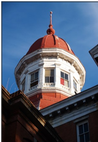
Babcock Building Cupola

DMH MISSION: TO SUPPORT THE RECOVERY OF PEOPLE WITH MENTAL ILLNESSES.