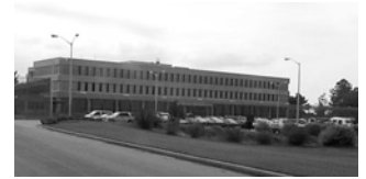
Columbia Care Center – a 178-bed treatment facility for patients found Not Guilty by Reason of Insanity (NGRI) or not competent to stand trial. Located in Columbia.