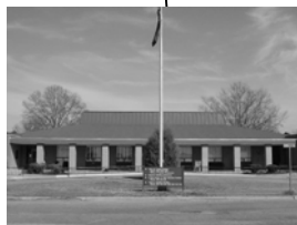
Tucker Nursing Care Center – a 516-bed nursing care center with 90 beds for veterans. Located in Columbia.