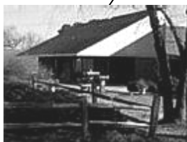
Morris Village Alcohol and Drug Addiction Treatment Center – a 120-bed alcohol and drug treatment center in Columbia.