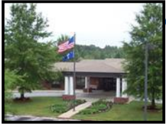
Richard M. Campbell Veterans Nursing Home Skilled nursing care facility for SC veterans located in Anderson