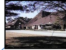
G. Werber Bryan Psychiatric Hospital Adult Services- Adult psychiatric care hospital located in Columbia Forensics- Court-ordered stabilization, restoration, evaluation, and ongoing treatment for people found not competent to stand trial or Not Guilty by Reason of Insanity. Located in Columbia