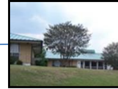
William S. Hall Psychiatric Institute Child and Adolescent psychiatric hospital in Columbia with acute, residential and alcohol and drug addiction treatment