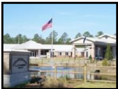
Veterans Victory House Skilled nursing care facility for SC veterans located in Walterboro