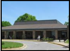
C.M. Tucker, Jr. Nursing Care Center Skilled nursing care facility located in Columbia comprising two pavilions: Roddey and Stone. Stone Pavilion specifically serves SC veterans.