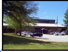
Patrick B. Harris Psychiatric Hospital Adult psychiatric care hospital located in Anderson