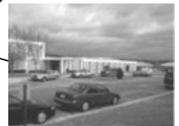
William S. Hall Psychiatric Institute – an 85-bed complex for children and adolescents. Located in Columbia.