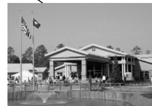
Veterans' Victory House – a 220-bed skilled nursing care center, Located in Walterboro.