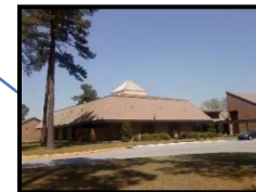
Morris Village Alcohol and Drug Addiction treatment Center Alcohol and drug addiction treatment hospital located in Columbia