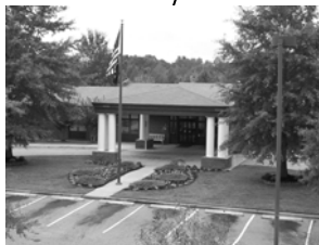
Richard M. Campbell Veterans' Nursing Home – a 220-bed skilled nursing care facility in Anderson.