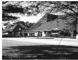
G. Werber Bryan Psychiatric Hospital – a 245-bed intensive care facility that serves 33 counties. Located in Columbia.