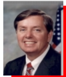
Senator Lindsey Graham US Senator (Invited)