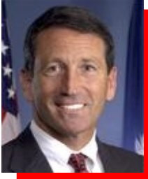
The Honorable Mark Sanford South Carolina Governor (Invited)