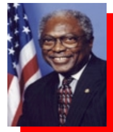
Representative James E. Clyburn US Congressman Majority Whip (Invited)